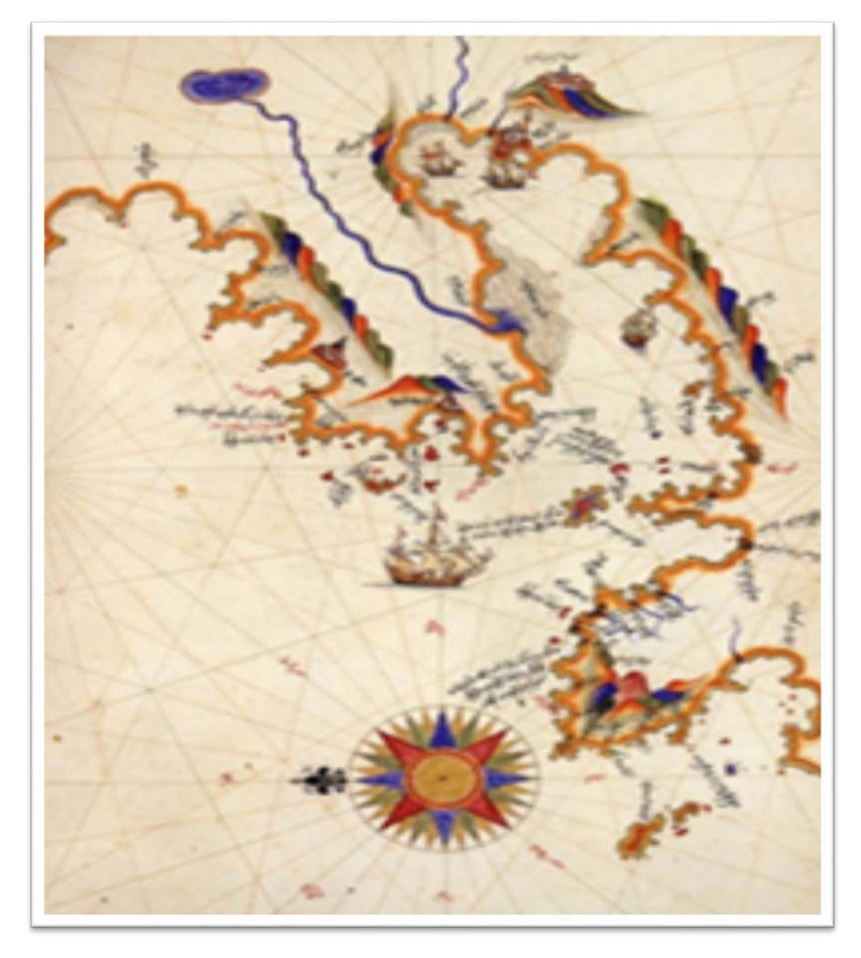
Figure 2. Port of Izmir and Its Surroundings

of ports and port trade. Piri Reis does not directly take into account the demographics of the port cities and the historical dimension of their commercial activities. His main purpose is to give some basic information necessary for ports, port cities and a safe maritime trade. For this reason, we can say that Sibel Zandi-Sayek filled the missing parts of the book regarding Izmir. Sayek considered it more appropriate to examine the Port City of Izmir in the context of urban relations. It is chronologically worth resuming the search on Izmir and Izmir Port two centuries after Piri Reis.